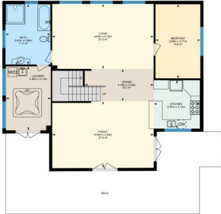
Main Floor Exterior Area 126.83 m 2

Main Building: Total Exterior Area Above Grade 192.92 m 2