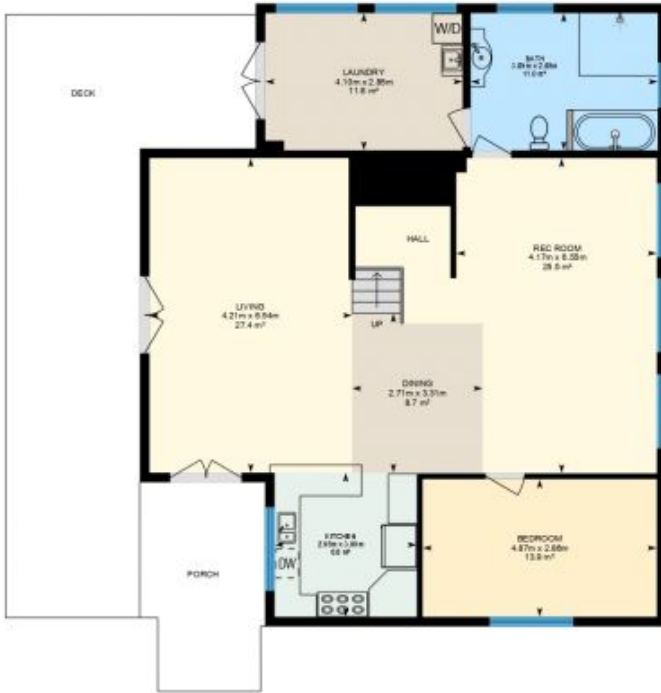
Main Floor Exterior Area 126.70 m 2

Main Building: Total Exterior Area Above Grade 192.80 m 2