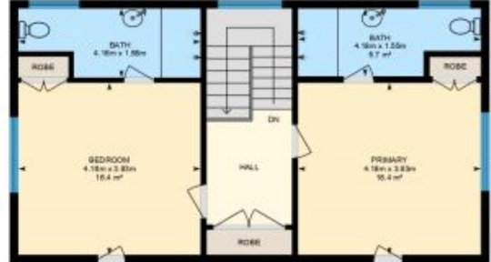
1st Floor Exterior Area 66.10 m 2